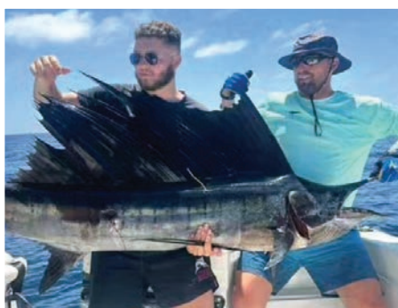
not something you see everyday

While we were seeing some action on the northern end of the grounds, the majority of the fleet were also busy with a good bite going on in the Ulladulla and Jervis Bay Canyons. Ulladulla Club boat Mayhem tagged a Sailfish on a live bait, Deftone had tagged a second fish and there was plenty going on down there.