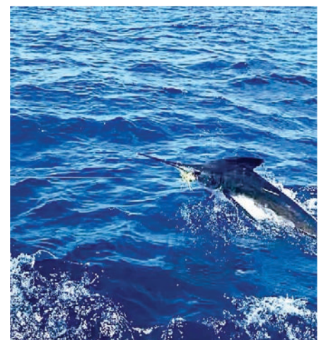
what its all about..