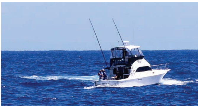
Dirty Deeds from Ulladulla.

The Friday morning dawned perfectly, we loaded the tank with Slimeys on the bait ground at Crookhaven Heads and headed for The Banks to fish the early tide change. Our baits had been in the water for around an hour when we had a marlin come up on our dredge teaser. He followed it for a minute or so before dropping back onto