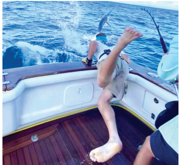
hold on tight...