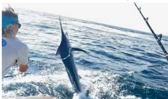
on the trace....