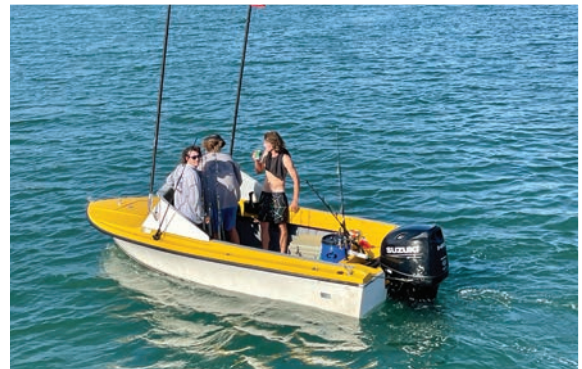
the boys on Deftone